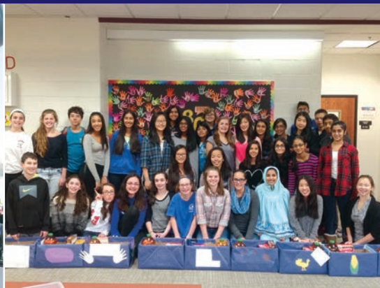
The AMIGOS develop leadership and personal character leading to lifelong values. Understanding this, the Grover Middle School AMIGOS prepared Thanksgiving baskets for families in need. The students held hot chocolate and soft pretzel sales to raise money to purchase all the trimmings for a Thanksgiving feast.