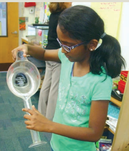
At Millstone River School , a leaky roof became a lesson. The Grade 5 mathematicians collected dripping water for five minutes, measured the water, did conversions, and concluded it would have taken ten days to fill a tub. Lucky for everyone, the leak was repaired shortly after it was discovered.

Residents of Plainsboro and West Windsor Townships are served by cable television channels on the Comcast and Verizon networks. Plainsboro residents have two channels: Channel 26 (Comcast) and Channel 26 (Verizon). West Windsor residents have three channels: Channel 27 (Comcast) and Channels 40 and 42 (Verizon). Check out the Bulletin Board for upcoming school events and watch school programs.