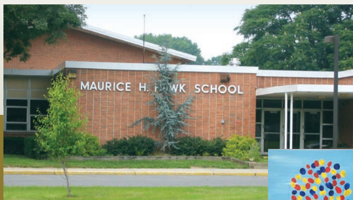
Throughout the school year, Maurice Hawk Elementary School celebrated 50 years of academic excellence. The Hawk Parent-Teacher Association curated a special display of memorabilia and hosted an anniversary art auction and gala to raise funds for assemblies, mini-grants, curriculum enrichment, and technology.