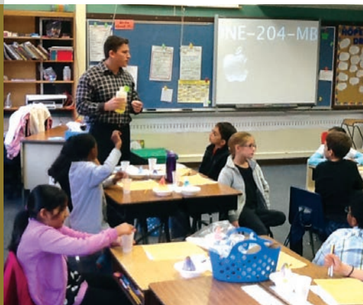
Grade 3 students at Dutch Neck Elementary School had the opportunity to experience science along with many eye-popping demonstrations showcasing the power of chemistry. These hands-on activities helped to open the minds of elementary students and allowed them see the reality of science.