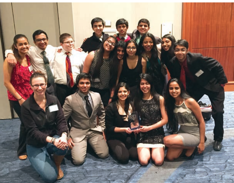
Model United Nations introduces students to the world of diplomacy, negotiations, and decision making through debates on current issues before the UN. The High School North Model UN team won First Place: Best Small Delegation at the Ivy League Conference and Best Large Delegation at another competition.

School begins on Wednesday, September 2, 2015. The full calendar is posted on the district web site, and includes four emergency closing dates, which means that if school is closed for an emergency or for inclement weather, school is in session for designated emergency closing days.