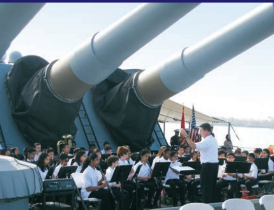
The Grade 7 Concert Band from Community Middle School performed to an audience of veterans on the U.S.S. New Jersey. The students participated in a special naval tradition and played the "Navy Hymn" while a wreath was cast overboard in honor of members of the armed forces who served in war and peace.