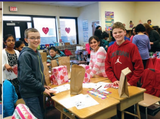
Students at Village School assembled gift bags filled with hygiene and grooming supplies, generously donated by students and families for a community service project. The bags, decorated by the students, were delivered to a local organization that assists families in their struggles to become independent.