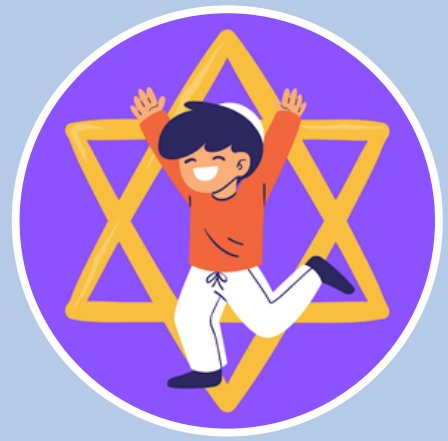
HSN Jewish Community Youth Club

Embark on a captivating exploration of Jewish customs, traditions, and holidays. Discover the significance of Rosh Hashanah, Yom Kippur, Chanukah, Passover, and timeless traditions like Bar Mitzvahs. Engage in interactive experiences at various stations guided by Jewish student leaders from your school, offering a deeper understanding of Jewish culture and fostering a sense of unity within the community.