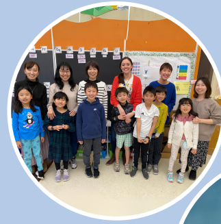
Dutch Neck Students and Families

Participate in an exploration of Japanese culture with Dutch Neck Elementary students and their families. Discover key facets like language, traditions, and holidays through engaging presentations. The Dutch Neck students will also lead hands-on activities, providing a firsthand experience for all participants. Don't miss this chance to learn and immerse yourself in the rich tapestry of Japanese culture.