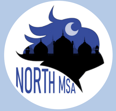
HSN Muslim Student Association

Arabic calligraphy, the art of beautiful handwriting, has long been a revered art form in the Islamic world. In this session, students will trace the history of Arabic calligraphy from its emergence in the Arabian Peninsula over 14 centuries ago through its development in empires and dynasties to become the modern Arabic we use today. Students will be provided with paper and brush pens and will learn to create their own Arabic calligraphy.