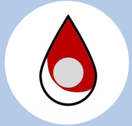
Project Full Stop

Join Project Full Stop to gain insights into menstruation and combat period stigma. Explore topics such as menstrual equity, the historical context of menstruation, and menstrual education. Engage in discussions and activities focused on enhancing our understanding and addressing current challenges for a more informed and equitable future.