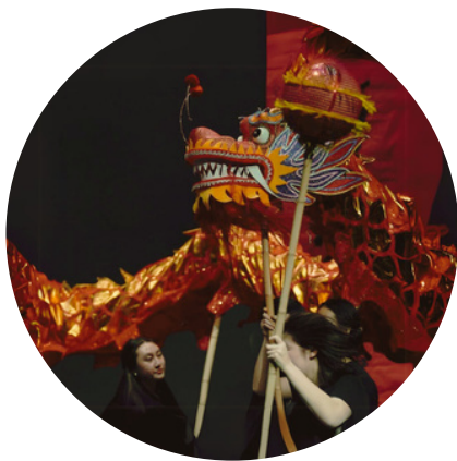
Chinese Culture Club