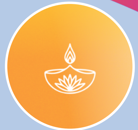
HSN Hindu Cultural Student Association

Join us on a cultural journey with HCSA to explore the rich values and history of Hinduism in our enlightening session. Discover various art forms tied to Hindu festivities, like painting diyas and applying henna. Delve into a brief lesson highlighting the cultural significance of these activities. This engaging session offers participants the chance to participate in three different activities, fostering a hands-on connection with Hindu traditions and a deeper appreciation for this vibrant and diverse culture.